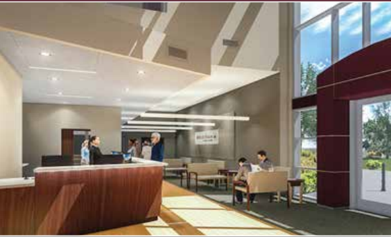
Rendering of new outpatient cardiology lobby.